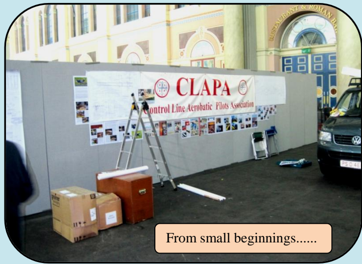
From small beginnings.....